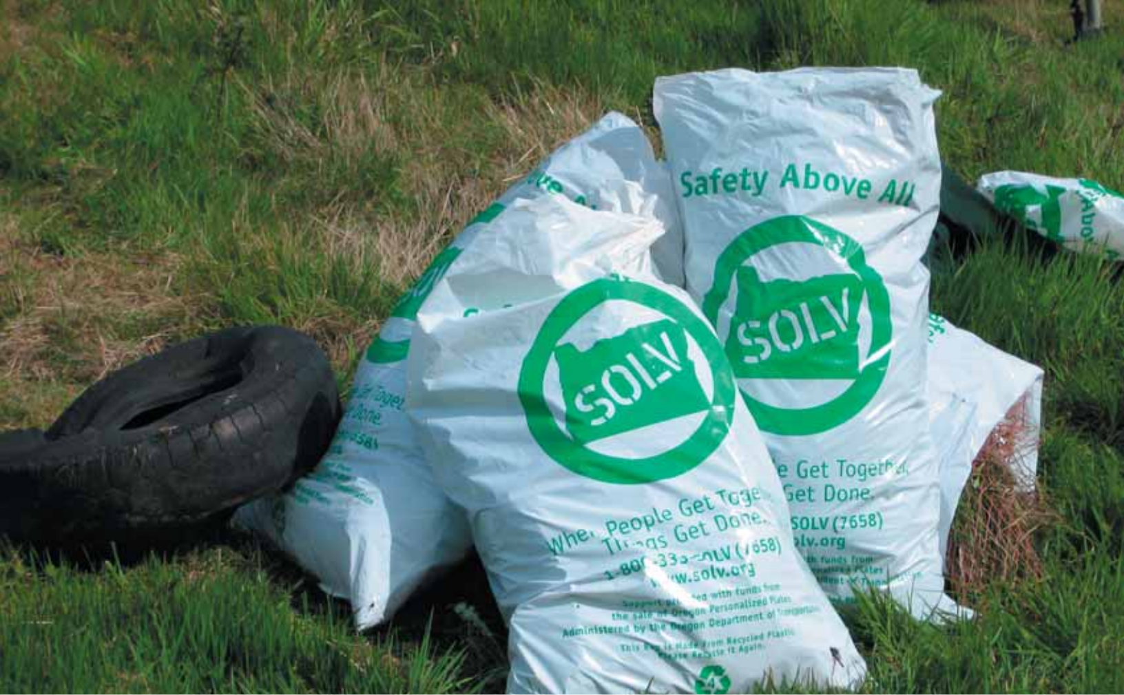
Photo: Bags of debris from Maroon SOLV IT site.

Please let us know if you are receiving multiple copies of this report. Thank you!