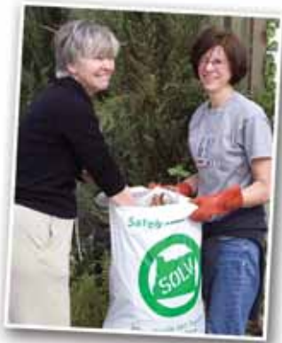
SOLV IT volunteers removing invasive plants from West Linn High School

These are the kinds of achievements studied last year by the University of Michigan, through a grant from the General Motors Foundation. You may recall that in 2005 GM worked with SOLV to understand how it might establish an organization similar to SOLV in Michigan. The culminating report last year delved into SOLV's economic, environmental, and social impact on the state of Oregon. Among the remarkable findings in the study was the leverage ratio that SOLV programs provide in support to public agencies: $64.08 to $1.00.