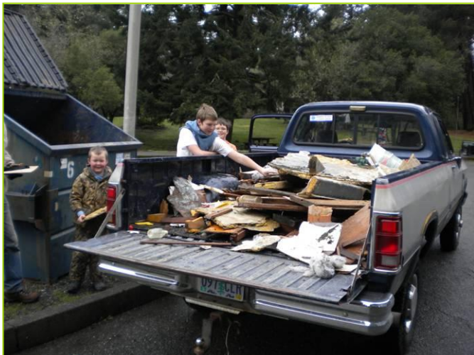
Students help out in Bandon