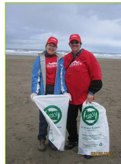
Fred Meyer volunteers clean up at Seaside.