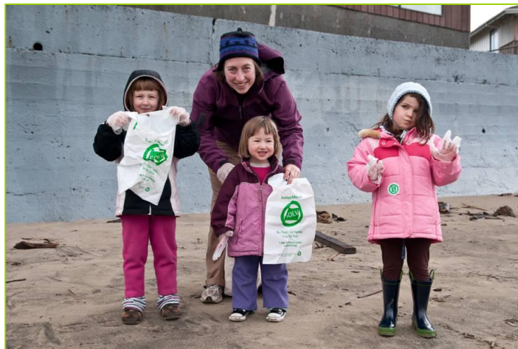
Passing on a legacy of stewardship