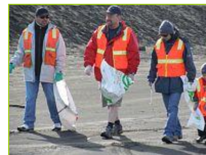
Western Oregon Waste volunteers at Fort Stevens. WOW donated disposal and recycling services at several North Coast sites